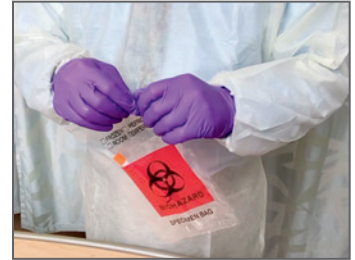
Figure 4. Handling the Nasopharyngeal Swab Specimen.

Shown is the swab in a collection tube placed in a biohazard bag.